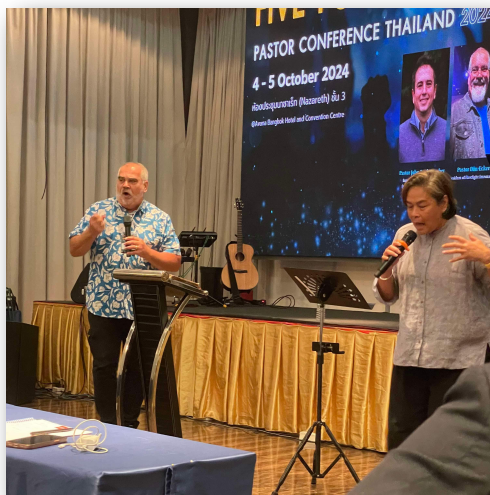
Recent pastors conference in Bangkok

Join us each month in prayer and in financial giving as we launch out in 2025. Through your partnership, we are serving a growing number of church leaders, organizations, ministries, people and projects through a wide range of Global Training Platforms, Kingdom Advance Partnerships , and we are providing Care For Kingdom Families through educational assistance programs to reach children, families and young adults from fatherless homes in selected areas across Thailand.